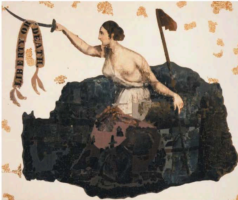
A flag carried at the Battle of San Jacinto during the Texas revolt of 1836 portrays a female figure displaying the rallying cry "Liberty or Death."

The appearance of Santa Anna's army sparked a chaotic revolt in Texas. The rebels formed a provisional government that soon called for Texan independence. On March 13, 1836, Santa Anna's army stormed the Alamo, a mission compound in San Antonio, killing its 187 American and Tejano defenders. "Remember the Alamo" became the Texans' rallying cry. In April, forces under Sam Houston, a former governor of Tennessee, routed Santa Anna's army at the Battle of San Jacinto and forced him to recognize Texan independence. Houston was soon elected the first president of the Republic of Texas. In 1837, the Texas Congress called for union with the United States. But fearing the political disputes certain to result from an attempt to add another slave state to the Union, Presidents Andrew Jackson and Martin Van